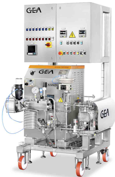
Pharma Skid Homogenizer 2006

Custom-equipped plug & play skids with GEA Ariete homogenizers facilitate demanding production steps and make new processes possible