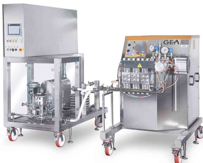
Customized and flexible Pharma Skid homogenizer 3015, able to homogenize 250 l/h at 1,500 bar

The growing success of plug & play laboratory skids has taken GEA to a new project step: developing Pharma Skids also for industrial homogenizers. Our specialized engineer teams have studied and designed high-pressure skid solutions according to customers' needs. Suitable materials are selected according to each application, in order to always guarantee reliable and long-lasting components.