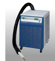
Electrical Cooling Unit