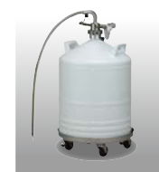
Auto LN 2 Gas Cooling Unit